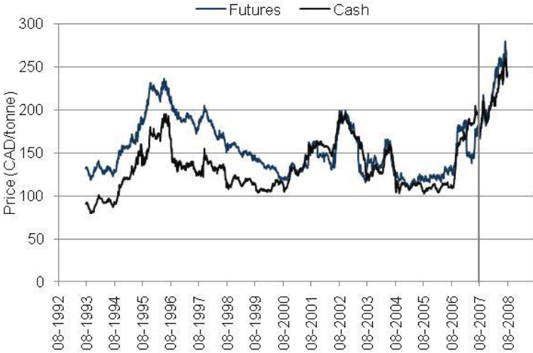
Figure 1. Cash and futures price for western barley (per metric tonne)